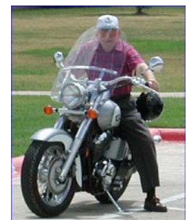
What a biker!