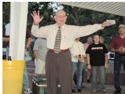
Doc entertaining a crowd